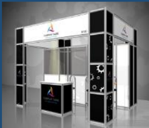
This picture is subject to modifications