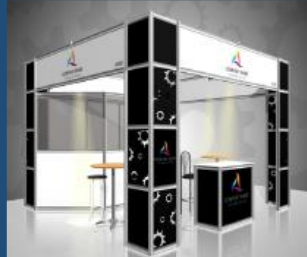
This picture is subject to modifications

800 companies 1200 participants 10000 BtoB meetings 25 countries represented