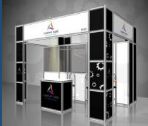
This picture is subject to modifications